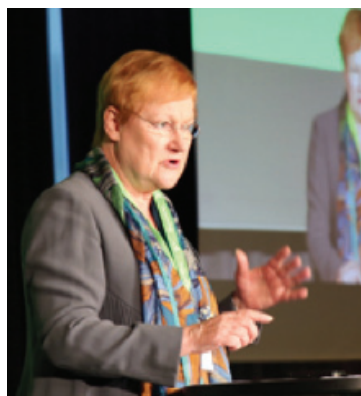
Tarja Halonen, Co-Chair, UN Secretary-General's High-Level Panel on Global Sustainability