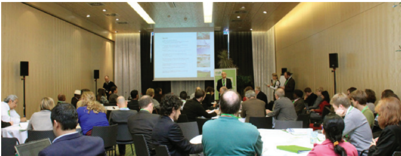
Dialogue session on Economics of Land Degradation (ELD)

environmental impact assessments are inadequate for this. However, many noted that enforcing regeneration policies requires strong leadership, significant financial investment and continuous public pressure. Several contributors noted the “natural resource curse” is reinforced when states give generous concessions to mining companies, who subsequently fail to meet expectations that they will bridge the gap in infrastructural development and provision of basic services. Stressing that this demonstrates that Voluntary Guidelines are not effective, one participant noted the need to prioritize enforcement and good integration of policies at national and higher levels.