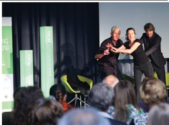
Theatersport Berlin improvisational theater group, opened the kick-off session

This report covers the sessions that took place from 28-30 October. It first provides a brief history of the Global Soil Week and overview of related meetings and initiatives in the past year. It then summarizes discussions that took place during plenary sessions, followed by detailed summaries of 12 of the 22 interactive dialogue sessions held over the three days. After a brief outline of topics discussed during the "open space workshops" on 31 October the report concludes with a list of upcoming meetings.