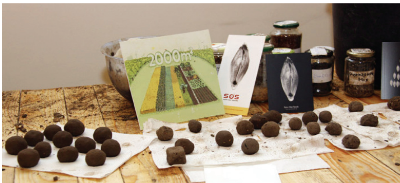
Seed balls from the Save our Seeds (SOS) exhibition